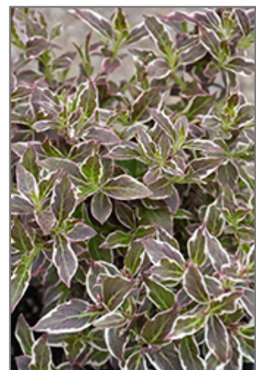
My Monet Purple Effect Weigela foliage