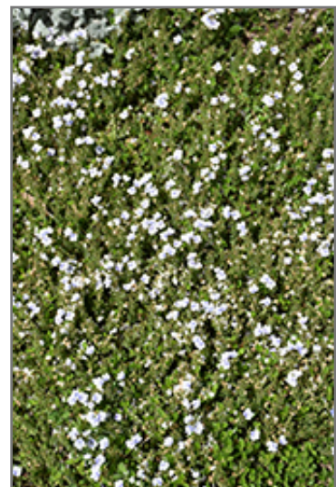
Snowmass Blue-Eyed Veronica in bloom