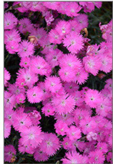
Firewitch Pinks flowers

Firewitch Pinks is an herbaceous evergreen perennial with a mounded form. It brings an extremely fine and delicate texture to the garden composition and should be used to full effect.