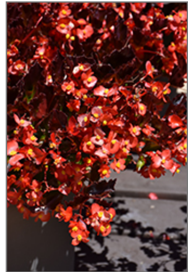
Hula Red Begonia flowers

Hula Red Begonia is an herbaceous annual with a ground-hugging habit of growth. Its medium texture blends into the garden, but can always be balanced by a couple of finer or coarser plants for an effective composition.