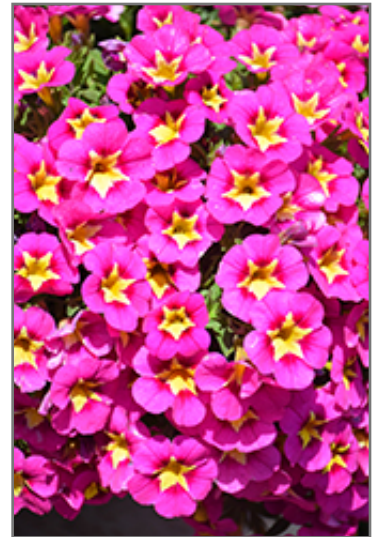
Bumble Bee Hot Pink Calibrachoa flowers

Bumble Bee Hot Pink Calibrachoa is a dense herbaceous annual with a trailing habit of growth, eventually spilling over the edges of hanging baskets and containers. Its medium texture blends into the garden, but can always be balanced by a couple of finer or coarser plants for an effective composition.