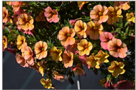
MiniFamous Uno Orange + Red Vein Calibrachoa flowers

MiniFamous Uno Orange + Red Vein Calibrachoa is a dense herbaceous annual with a trailing habit of growth, eventually spilling over the edges of hanging baskets and containers. Its medium texture blends into the garden, but can always be balanced by a couple of finer or coarser plants for an effective composition.