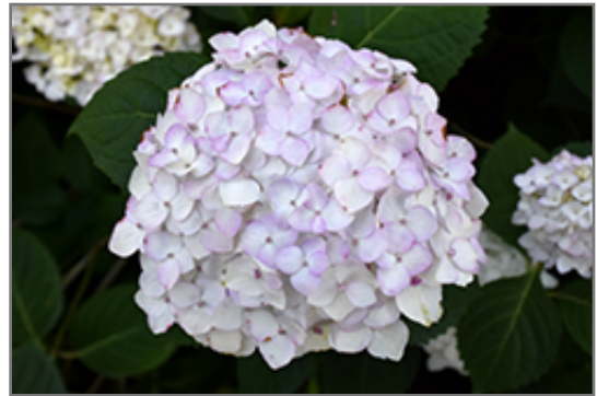
Blushing Bride Hydrangea flowers

Blushing Bride Hydrangea is recommended for the following landscape applications;