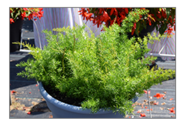
FuzzyFern Frizz Asparagus Fern

FuzzyFern Frizz Asparagus Fern is a dense herbaceous annual with a trailing habit of growth, eventually spilling over the edges of hanging baskets and containers. It brings an extremely fine and delicate texture to the garden composition and should be used to full effect.