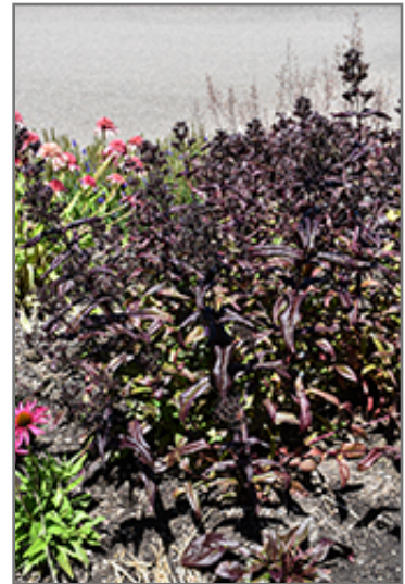
Dakota Burgundy Beard Tongue