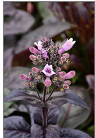
Dakota Burgundy Beard Tongue flowers

Dakota Burgundy Beard Tongue has masses of beautiful spikes of shell pink tubular flowers with lavender overtones, white throats and lavender streaks rising above the foliage from early to mid summer, which are most effective when planted in groupings. The flowers are excellent for cutting. Its attractive serrated pointy leaves emerge brick red in spring, turning burgundy in colour with showy dark green variegation and tinges of crimson. As an added bonus, the foliage turns a gorgeous dark red in the fall. The dark red fruits with black overtones are held in abundance in spectacular clusters from late summer to early winter. The dark red stems are very colorful and add to the overall interest of the plant.