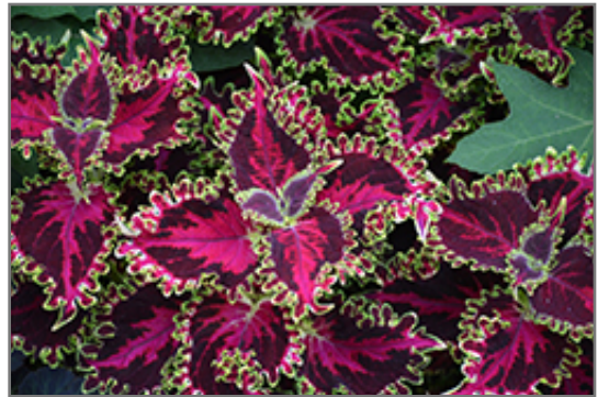
Volcanica Solar Flare Coleus foliage

Volcanica Solar Flare Coleus is an herbaceous annual with a mounded form. Its medium texture blends into the garden, but can always be balanced by a couple of finer or coarser plants for an effective composition.