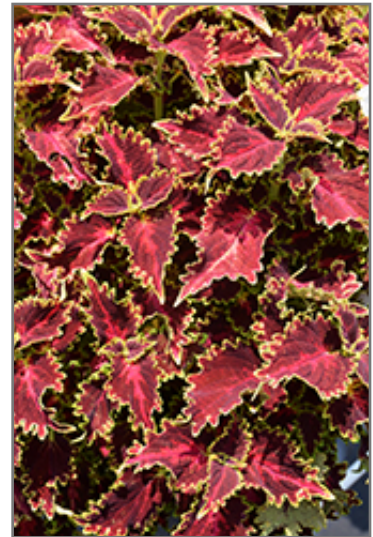
Volcanica Solar Flare Coleus foliage

Volcanica Solar Flare Coleus is a fine choice for the garden, but it is also a good selection for planting in outdoor containers and hanging baskets. It can be used either as 'filler' or as a 'thriller' in the 'spiller-thriller-filler' container combination, depending on the height and form of the other plants used in the container planting. It is even sizeable enough that it can be grown alone in a suitable container. Note that when growing plants in outdoor containers and baskets, they may require more frequent waterings than they would in the yard or garden.