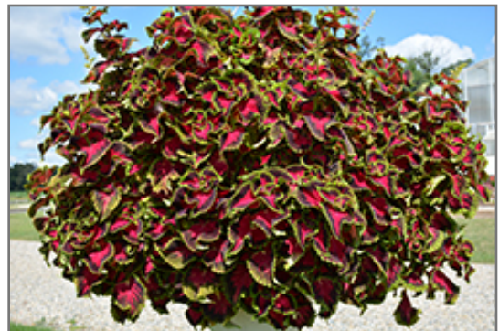
Heartbreaker Coleus