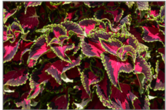
Heartbreaker Coleus foliage

Heartbreaker Coleus is an herbaceous annual with an upright spreading habit of growth. Its medium texture blends into the garden, but can always be balanced by a couple of finer or coarser plants for an effective composition.