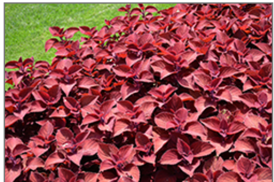
Ruby Slippers Coleus foliage