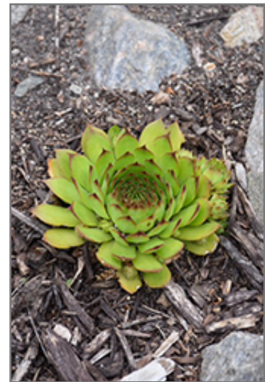
Sunset Hens And Chicks