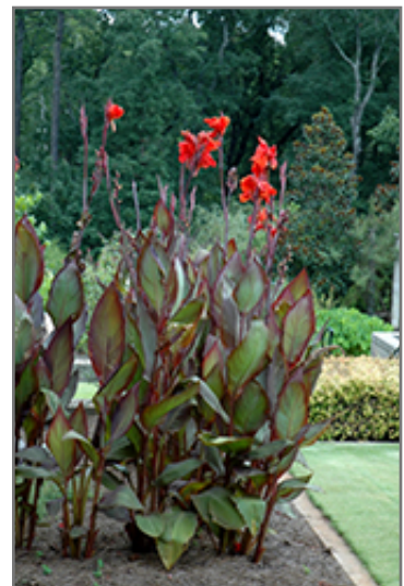
Australia Canna in bloom