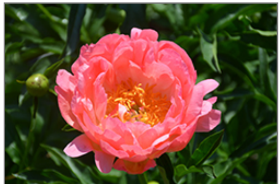
Coral Sunset Peony flowers