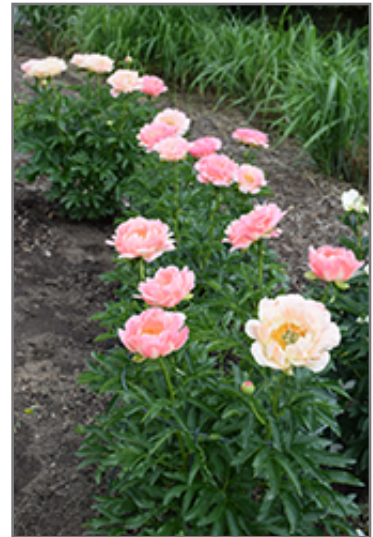
Coral Sunset Peony in bloom

This plant does best in full sun to partial shade. It does best in average to evenly moist conditions, but will not tolerate standing water. It is not particular as to soil pH, but grows best in rich soils. It is somewhat tolerant of urban pollution. This particular variety is an interspecific hybrid. It can be propagated by division; however, as a cultivated variety, be aware that it may be subject to certain restrictions or prohibitions on propagation.