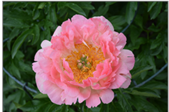
Coral Sunset Peony flowers (faded)

Coral Sunset Peony is an herbaceous perennial with a more or less rounded form. Its medium texture blends into the garden, but can always be balanced by a couple of finer or coarser plants for an effective composition.