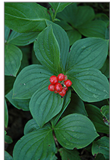
Bunchberry fruit

2901 ST. MARY'S ROAD - WINNIPEG, MANITOBA - R2N 4A6 - (204) 255-7353