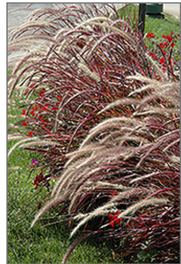
Fireworks Fountain Grass

Fireworks Fountain Grass is a fine choice for the garden, but it is also a good selection for planting in outdoor pots and containers. Because of its height, it is often used as a 'thriller' in the 'spiller-thriller-filler' container combination; plant it near the center of the pot, surrounded by smaller plants and those that spill over the edges. It is even sizeable enough that it can be grown alone in a suitable container. Note that when growing plants in outdoor containers and baskets, they may require more frequent waterings than they would in the yard or garden.