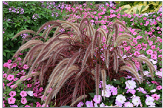
Fireworks Fountain Grass

Fireworks Fountain Grass is an herbaceous annual with a shapely form and gracefully arching foliage. It brings an extremely fine and delicate texture to the garden composition and should be used to full effect.