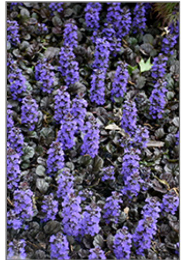
Black Scallop Bugleweed flowers

This plant will require occasional maintenance and upkeep, and should not require much pruning, except when necessary, such as to remove dieback. It is a good choice for attracting butterflies to your yard, but is not particularly attractive to deer who tend to leave it alone in favor of tastier treats. Gardeners should be aware of the following characteristic(s) that may warrant special consideration;