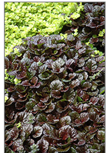
Black Scallop Bugleweed

2901 ST. MARY'S ROAD - WINNIPEG, MANITOBA - R2N 4A6 - (204) 255-7353