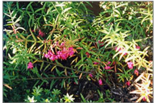
Dwarf Turkestan Burning Bush flowers

This shrub performs well in both full sun and full shade. It is very adaptable to both dry and moist locations, and should do just fine under typical garden conditions. It is not particular as to soil type or pH. It is highly tolerant of urban pollution and will even thrive in inner city environments. This is a selected variety of a species not originally from North America.