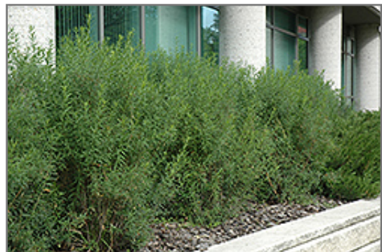
Dwarf Turkistan Burning Bush