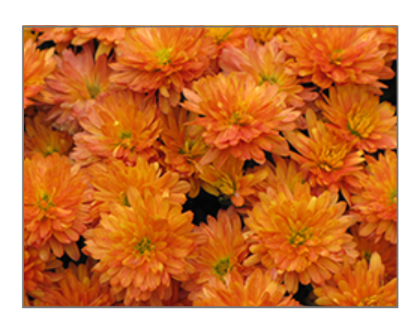
Jacqueline Orange Fusion Chrysanthemum flowers