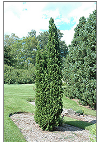
Degroot's Spire Arborvitae

Degroot's Spire Arborvitae is recommended for the following landscape applications;