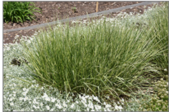
Variegated Reed Grass