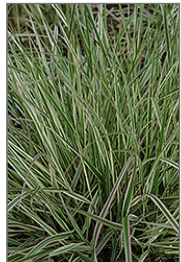
Variegated Reed Grass foliage

2901 ST. MARY'S ROAD - WINNIPEG, MANITOBA - R2N 4A6 - (204) 255-7353