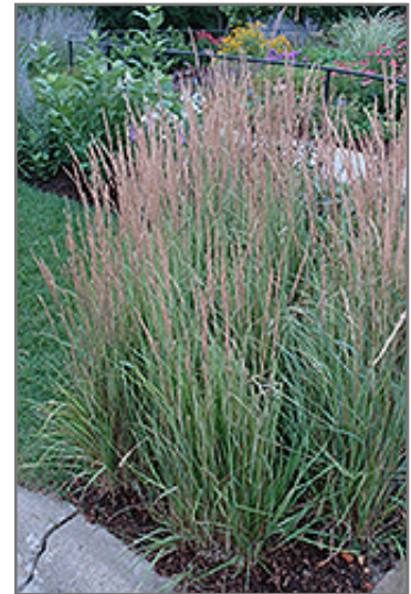
Variegated Reed Grass in bloom

Variegated Reed Grass is primarily grown for its highly ornamental fruit. The tan seed heads are carried on showy plumes displayed in abundance from late summer to late winter. Its attractive grassy leaves are green in colour with showy white variegation. The foliage often turns tan in fall. It features bold plumes of rose flowers rising above the foliage in mid summer. The gold stems can be quite attractive.