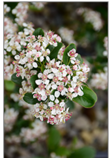
Low Scape Mound Aronia flowers