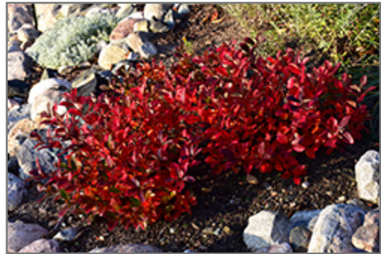
Low Scape Mound Aronia in fall