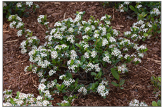
Low Scape Mound Aronia in bloom

Low Scape Mound Aronia is a multi-stemmed deciduous shrub with a mounded form. Its average texture blends into the landscape, but can be balanced by one or two finer or coarser trees or shrubs for an effective composition.