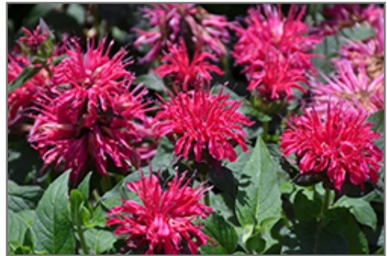
Balmy Rose Beebalm flowers

Balmy Rose Beebalm is an herbaceous perennial with a mounded form. Its medium texture blends into the garden, but can always be balanced by a couple of finer or coarser plants for an effective composition.