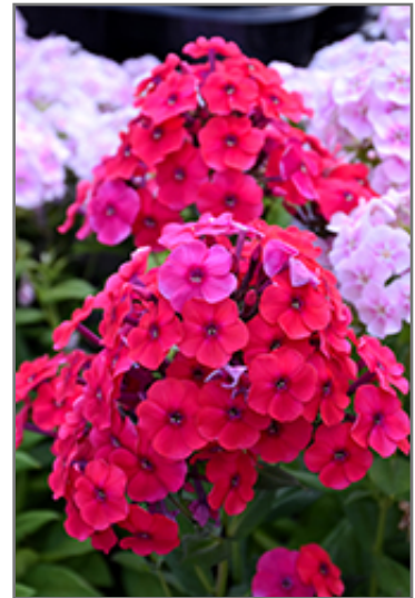
Red Riding Hood Garden Phlox flowers

Red Riding Hood Garden Phlox is recommended for the following landscape applications;