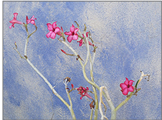
Desert Rose flowers

This plant is not reliably hardy in our region, and certain restrictions may apply; contact the store for more information.