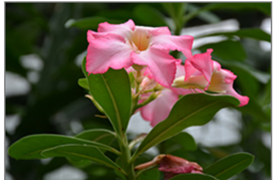
Desert Rose flowers

Desert Rose is a multi-stemmed evergreen shrub with an upright spreading habit of growth. Its average texture blends into the landscape, but can be balanced by one or two finer or coarser trees or shrubs for an effective composition.