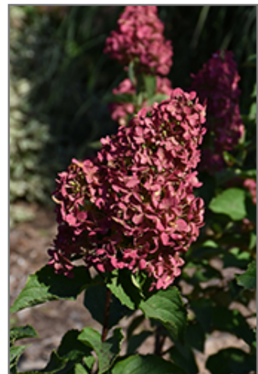
Berry White Hydrangea flowers (faded)

2901 ST. MARY'S ROAD - WINNIPEG, MANITOBA - R2N 4A6 - (204) 255-7353