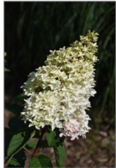
Berry White Hydrangea flowers

Berry White Hydrangea is recommended for the following landscape applications;