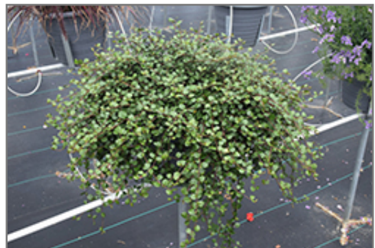
Big Leaf Creeping Wire Vine