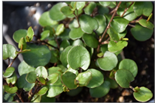
Big Leaf Creeping Wire Vine foliage