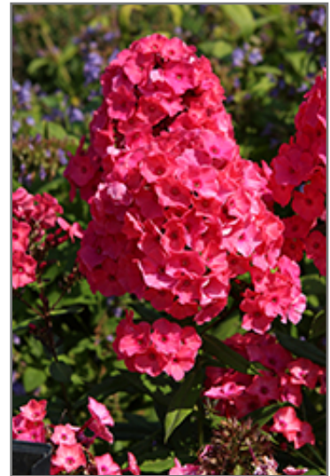
Super Ka-Pow Coral Garden Phlox flowers