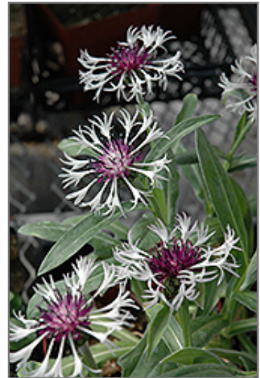
Amethyst In Snow Cornflower flowers