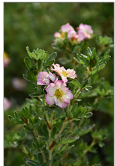
Happy Face Hearts Potentilla flowers