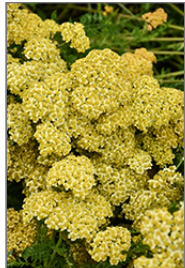
Milly Rock Yellow Terracotta Yarrow flowers

Milly Rock Yellow Terracotta Yarrow is an herbaceous perennial with a mounded form. Its relatively fine texture sets it apart from other garden plants with less refined foliage.