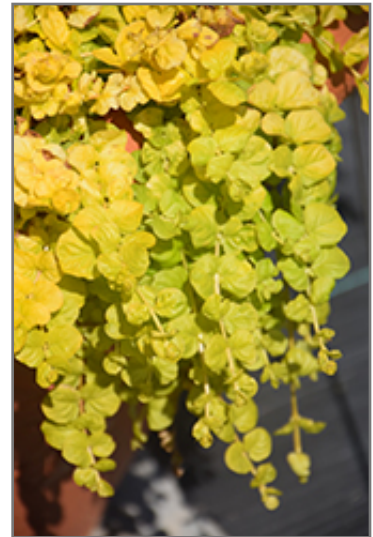
Goldilocks Creeping Jenny foliage

Goldilocks Creeping Jenny is a dense spreading perennial with a ground-hugging habit of growth. Its relatively fine texture sets it apart from other garden plants with less refined foliage.