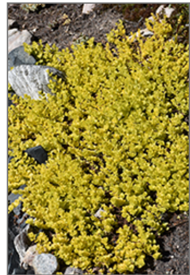
Goldilocks Creeping Jenny

Goldilocks Creeping Jenny is a fine choice for the garden, but it is also a good selection for planting in outdoor containers and hanging baskets. Because of its spreading habit of growth, it is ideally suited for use as a 'spiller' in the 'spiller-thriller-filler' container combination; plant it near the edges where it can spill gracefully over the pot. Note that when growing plants in outdoor containers and baskets, they may require more frequent waterings than they would in the yard or garden. Be aware that in our climate, most plants cannot be expected to survive the winter if left in containers outdoors, and this plant is no exception. Contact our experts for more information on how to protect it over the winter months.