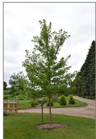
Matador Maple

2901 ST. MARY'S ROAD - WINNIPEG, MANITOBA - R2N 4A6 - (204) 255-7353