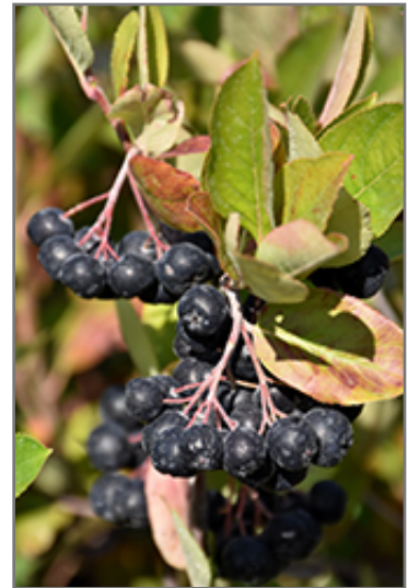
Viking Chokeberry fruit

This shrub should only be grown in full sunlight. It is an amazingly adaptable plant, tolerating both dry conditions and even some standing water. It is not particular as to soil type or pH, and is able to handle environmental salt. It is somewhat tolerant of urban pollution. This particular variety is an interspecific hybrid.