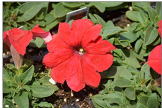
Pretty Grand Red Petunia flowers