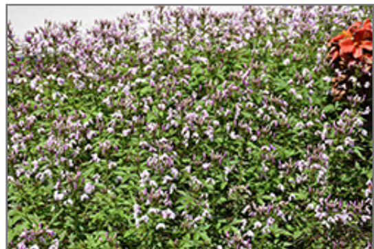
Clio Magenta Spiderflower in bloom